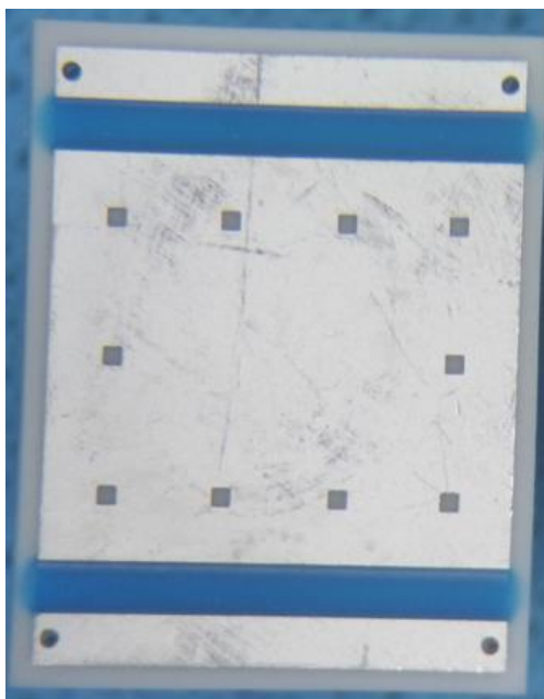
Backside Current Appearance