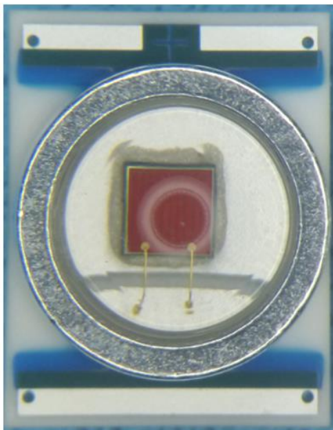
Frontside Current Appearance