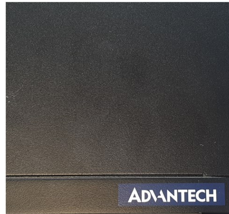
New solution: Powder Coating