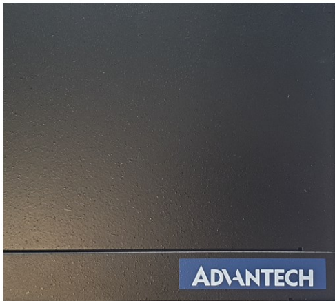
Current solution: Liquid Coating