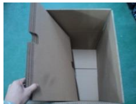
Place 5 Cardboard Insert on Bottom

Before: 10 cushioning cardboard inserts and 1 sponge insert shall be placed in each carton.