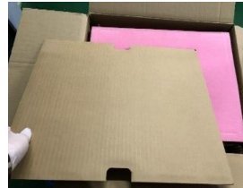
Place 1 cardboard insert on top