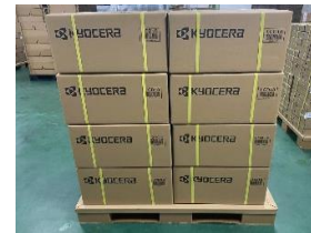
4 layers per pallet (total 16 cartons)