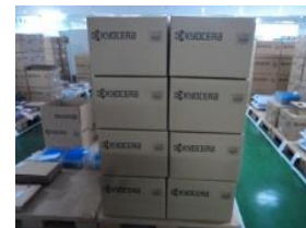
4 layers per pallet (total 16 cartons)