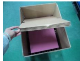
Place 5 cardboard inserts on top