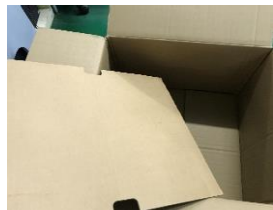
Place 1 Cardboard inset on bottom