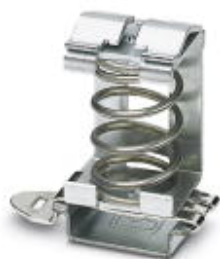
Shield connection terminal block, for applying the shield to busbars

Please be informed that the data shown in this PDF Document is generated from our Online Catalog. Please find the complete data in the user's documentation. Our General Terms of Use for Downloads are valid ( http://phoenixcontact.com/download )