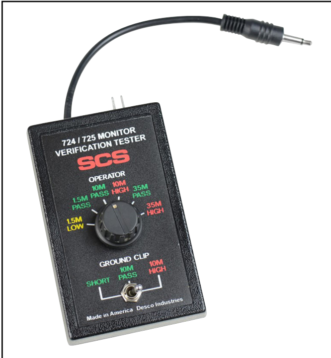
Figure 1. SCS 770065 Verification Tester