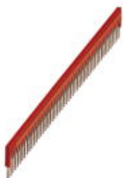
Plug-in bridge, pitch: 3.5 mm, number of positions: 50, color: red

Please be informed that the data shown in this PDF Document is generated from our Online Catalog. Please find the complete data in the user's documentation. Our General Terms of Use for Downloads are valid ( http://phoenixcontact.com/download )